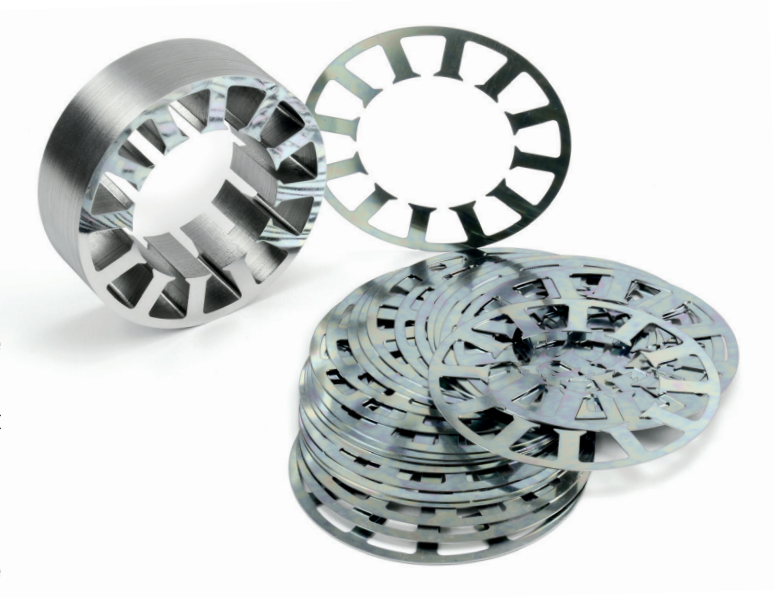
Laminations and an assembled stator produced from VACODUR 49 strip material